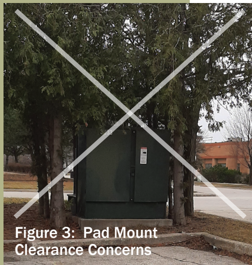
Figure 3: Pad Mount Clearance Concerns