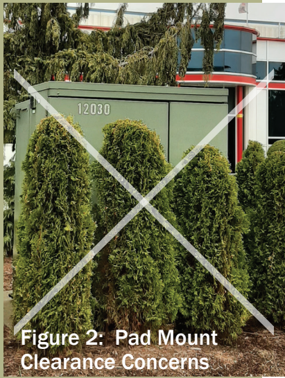
Figure 2: Pad Mount Clearance Concerns